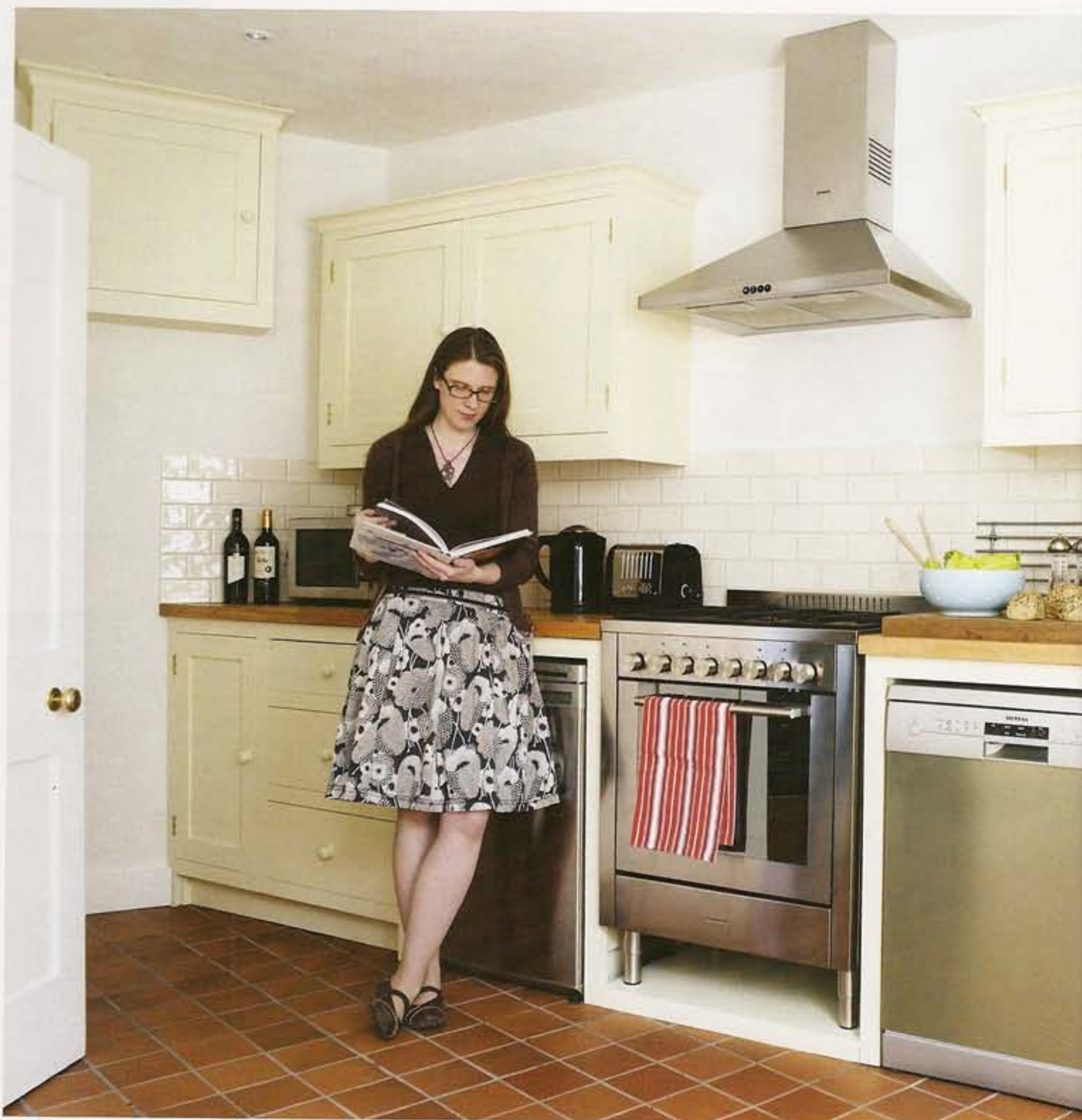
MADE TO MEASURE (above) The bespoke kitchen units were designed to make the best use of the unusually shaped space