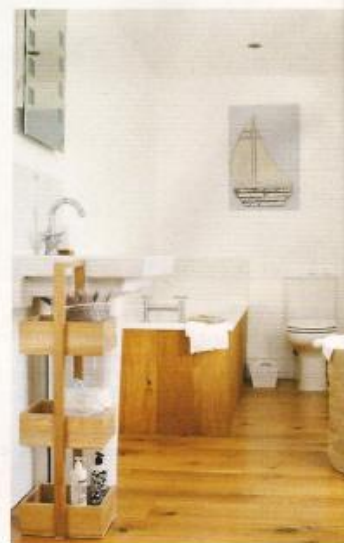
ABOVE Julie fitted simple white suites in both the first-floor bathrooms. 'With two shower rooms and two bathrooms I wanted to be sure that there is lots of hot water when we come in from the beach, so I installed two hot water tanks,' she says