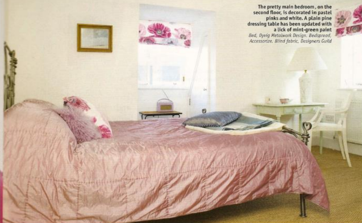
The pretty main bedroom, on the second floor, is decorated in pastel pinks and white. A plain pine dressing table has been updated with a lick of mint-green paint Bed, Dyvig Metalwork Design. Bedspread, Accessorize. Blind fabric, Designers Guild

FEATURE: CATELLA SHARHAN | STYLING: SEAN WILLIAMS | PHOTOGRAPHS: NICKI OUSP | PLANS: PERSOONIC.CO