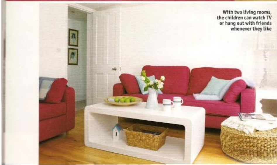
With two living rooms, the children can watch TV or hang out with friends whenever they like