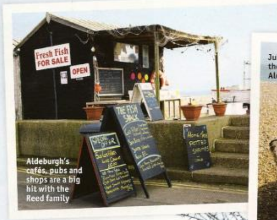
Aldeburgh's cafés, pubs and shops are a big hit with the Reed family