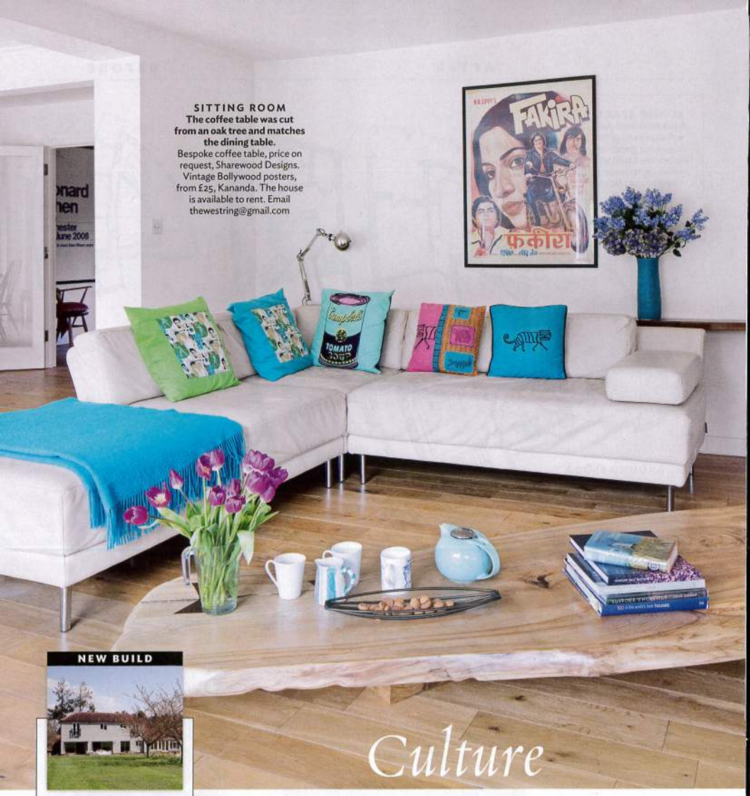
SITTING ROOM The coffee table was cut from an oak tree and matches the dining table. Bespoke coffee table, price on request, Sharewood Designs. Vintage Bollywood posters, from £25, Kananda. The house is available to rent. Email thewestring@gmail.com