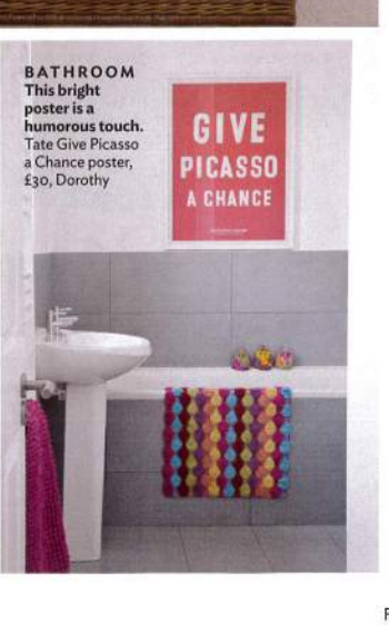
BATHROOM This bright poster is a humorous touch. Tate Give Picasso a Chance poster, £30, Dorothy