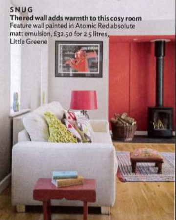
SNUG The red wall adds warmth to this cosy room. Feature wall painted in Atomic Red absolute matt emulsion, £32.50 for 2.5 litres, Little Greene