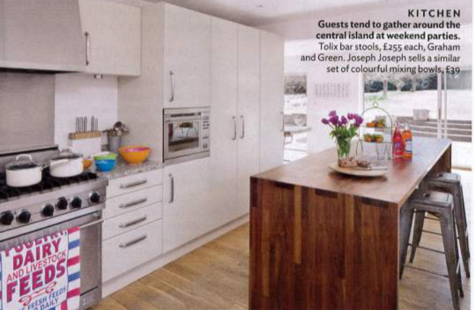
KITCHEN Guests tend to gather around the central island at weekend parties. Tolix bar stools, £255 each, Graham and Green. Joseph Joseph sells a similar set of colourful mixing bowls, £39