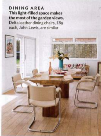
DINING AREA This light-filled space makes the most of the garden views. Delta leather dining chairs, £89 each, John Lewis, are similar